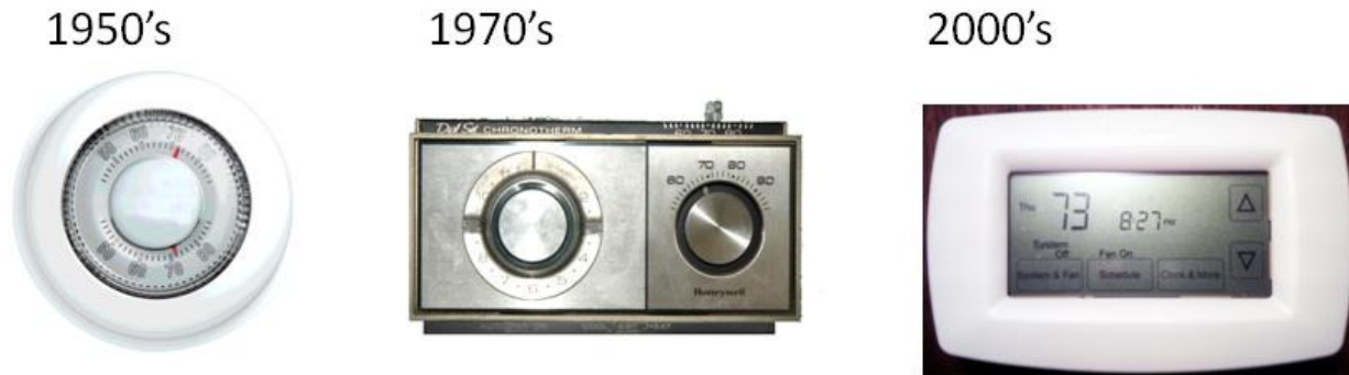
Figure 1: A round thermostat, a clock setback thermostat and touchscreen programmable thermostat.

Two types of thermostats have dominated the U.S. market: manual or mechanical thermostats, such as the Honeywell Round introduced in 1953, and PTs, such as the Honeywell RTH7600 shown in Figure 1. The modern PTs are digital successors to the clock or setback thermostat that grew in popularity after the 1973 energy crisis. Cheaper displays and increased processing power have permitted other features to emerge, such as touchscreens, color displays, internet connections, Home Area Networks (HAN) connections, remote controls (i.e., through cell phone or internet), voice controls, external communication (i.e., through radio-link to utility), ventilation, humidity controls, and zonal controls.